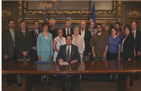
APAC at the Bill Signing Ceremony with Governor Pawlenty in 2007

For home buyout, the current maximum benefit levels may fall far below appraised values. Even at full value, it is often impossible for residents to find comparable re-